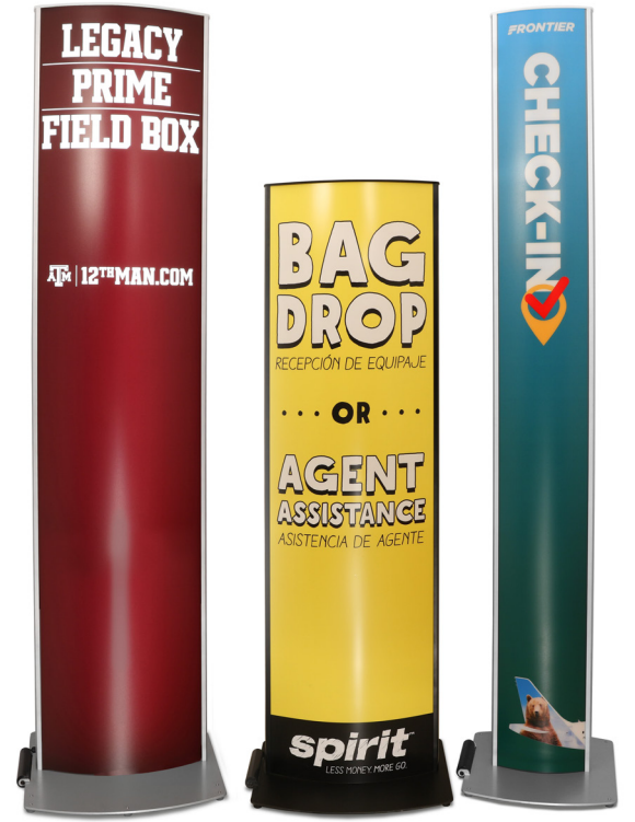
Standard Model: 22" X 92" Standard Model: 22" X 72" Custom Models Available:* (12" X 92" Shown)