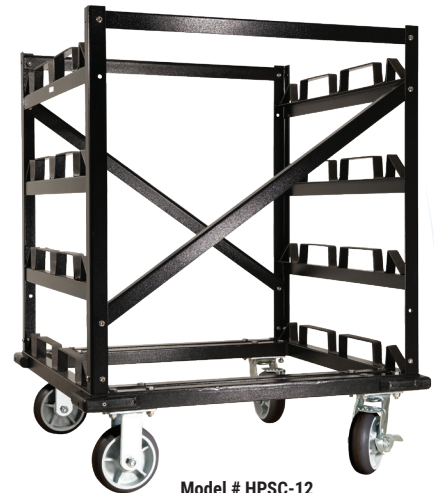
Model # HPSC-12