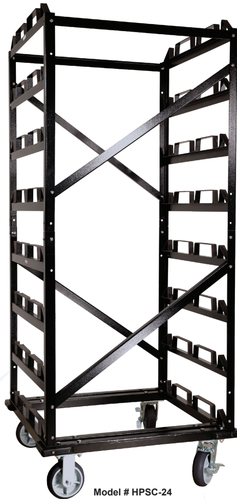
Model # HPSC-24

Assembles quickly and easily: in about a half hour by one or two people, compared to up to an hour and a half for other similar storage carts. All tools and hardware included.