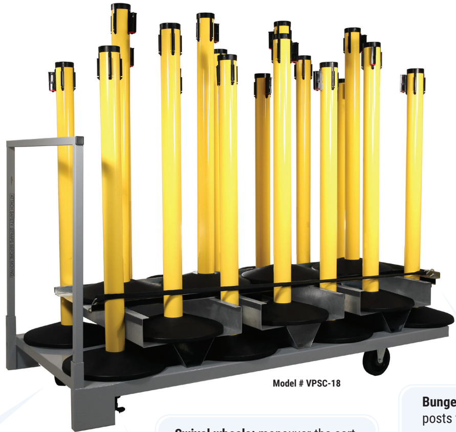
Model # VPSC-18

Swivel wheels: maneuver the cart easily and lock into place.