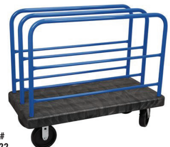
Model # PNPSC-22