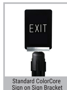
Standard ColorCore Sign on Sign Bracket