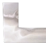
Polished Chrome PC