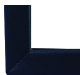
Smooth Black SB